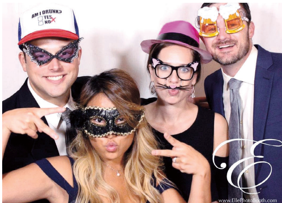
PHOTO Elle BOOTH

Impress Your Guests With Our Photo Booth At Your Event!